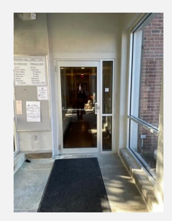
Coming from the parking lot, take a right as you enter the hallway and enter through the glass door.