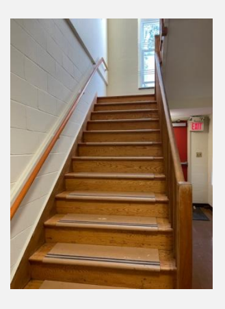
Go up the stairs.